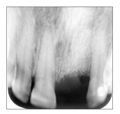
Fig. 1: X-ray taken in the area of tooth # 21 nine months after the guided bone regeneration treatment