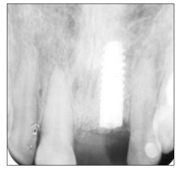
Fig. 3: X-ray showing the healed implant